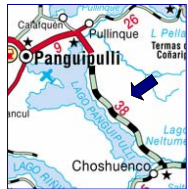
Location Map (See www.turistel.cl , Road map 'H')