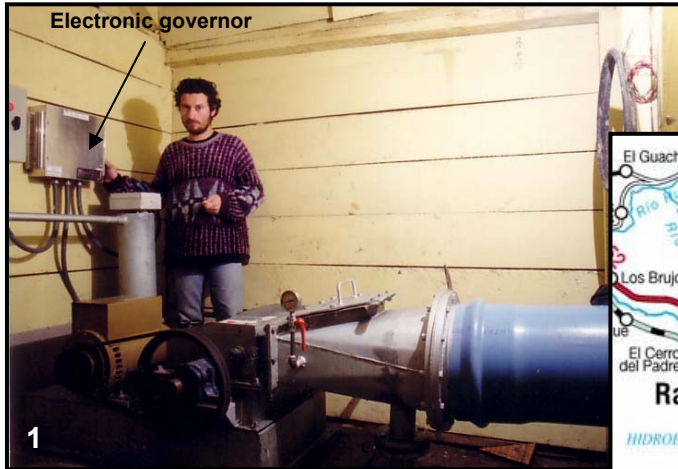
Location map (See www.turistel.cl , Road map 'G')