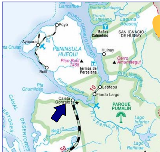
Location map (See www.turistel.cl , Road Map 'I')