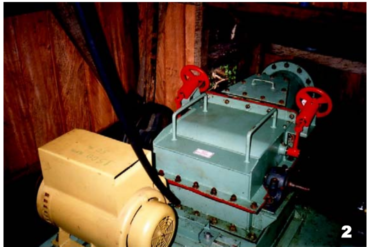
Fig. 2 Cross-flow turbine with 'twin' flow regulation valve